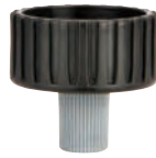
Drip Tap Adaptor 4.6mm (3/16")