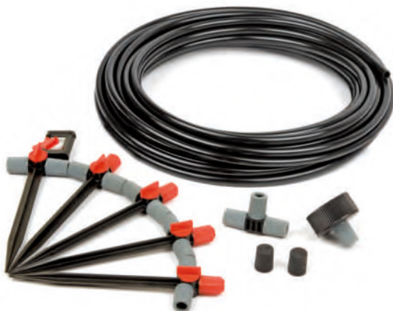
Micro-Drip Sprinkler System 4.6mm (3/16")