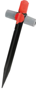
Shower Spray Nozzle 4.6mm (3/16")