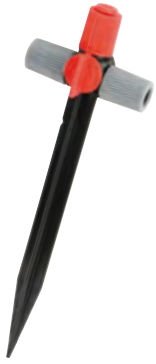
90° Spray Nozzle 4.6mm (3/16")