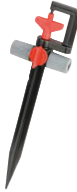
Rotor Sprinkler 4.6mm (3/16")