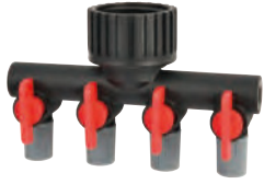
4-Zone Drip Irrigation Manifold 4.6mm (3/16")