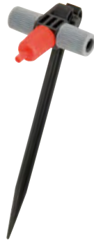
Drip Nozzle 4.6mm (3/16")