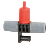
Inline Drip Nozzle 4.6mm (3/16")