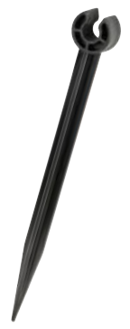
Pipe pegs 4.6mm (3/16")