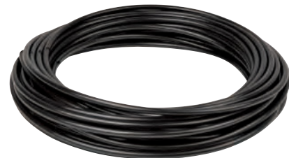
Drip Pipe 4.6mm (3/16")